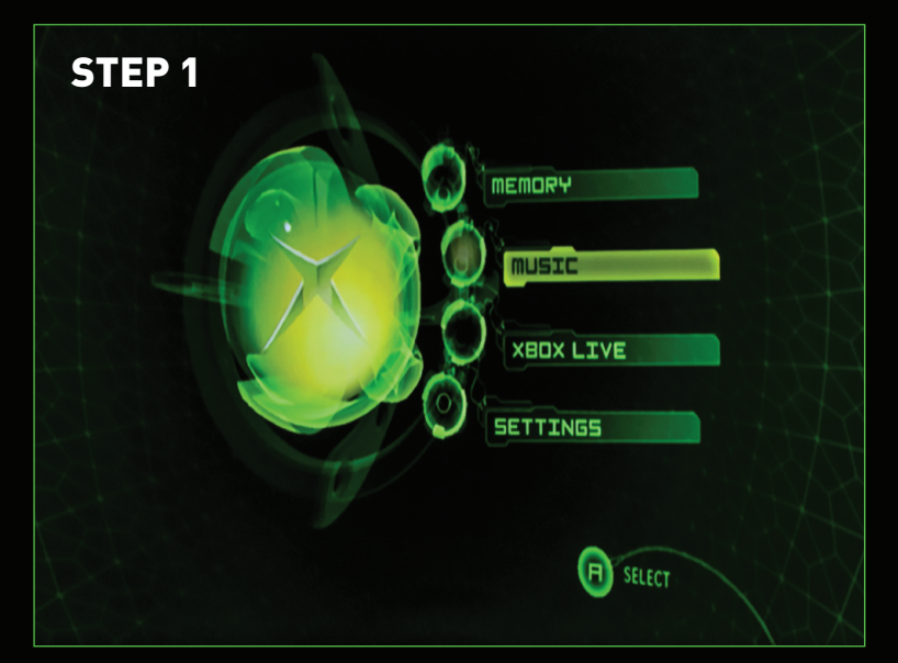
Start XBOX without any media inserted to boot into its main menu.

A full list of games and their compatibile resolutions are available online.