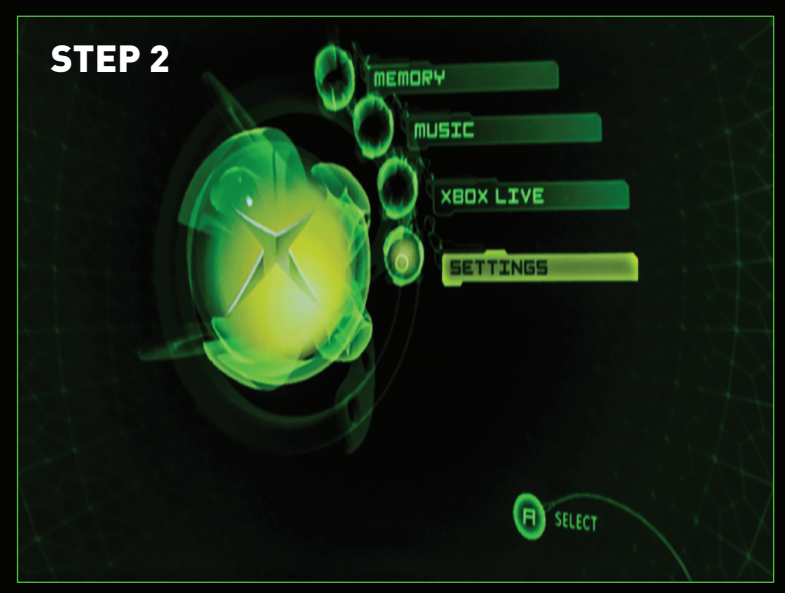
On the main menu screen, select "Settings".