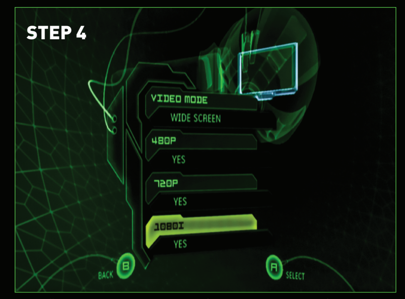
In the "Video" options, select 1080i (or desired resolution.)